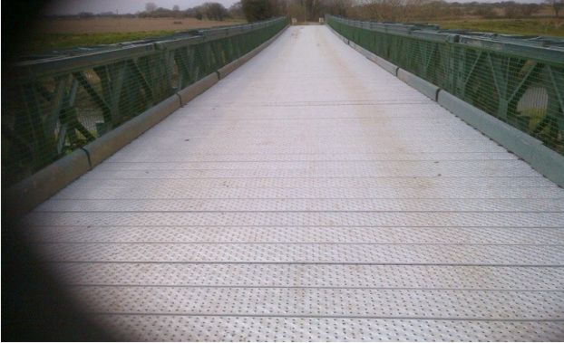
The Said Bridge - don't worry though it will be changed by next year's ride!!!!!!